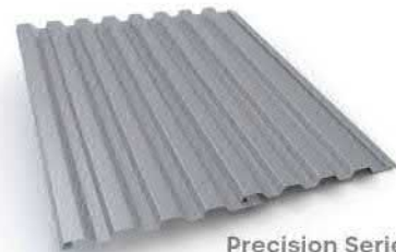
Precision Series HWP Metal Wall System Silver, Charcoal